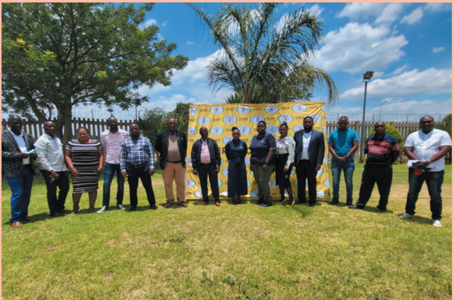
Blouberg Local Municipality leadership and mining houses representatives share a moment after fruitful engagements aimed at benefiting Blouberg communities.

The municipality is planning to host a mining seminar for further engagements with the mines. The Mining Forum will be held on quarterly basis to reflect on plans and projects.