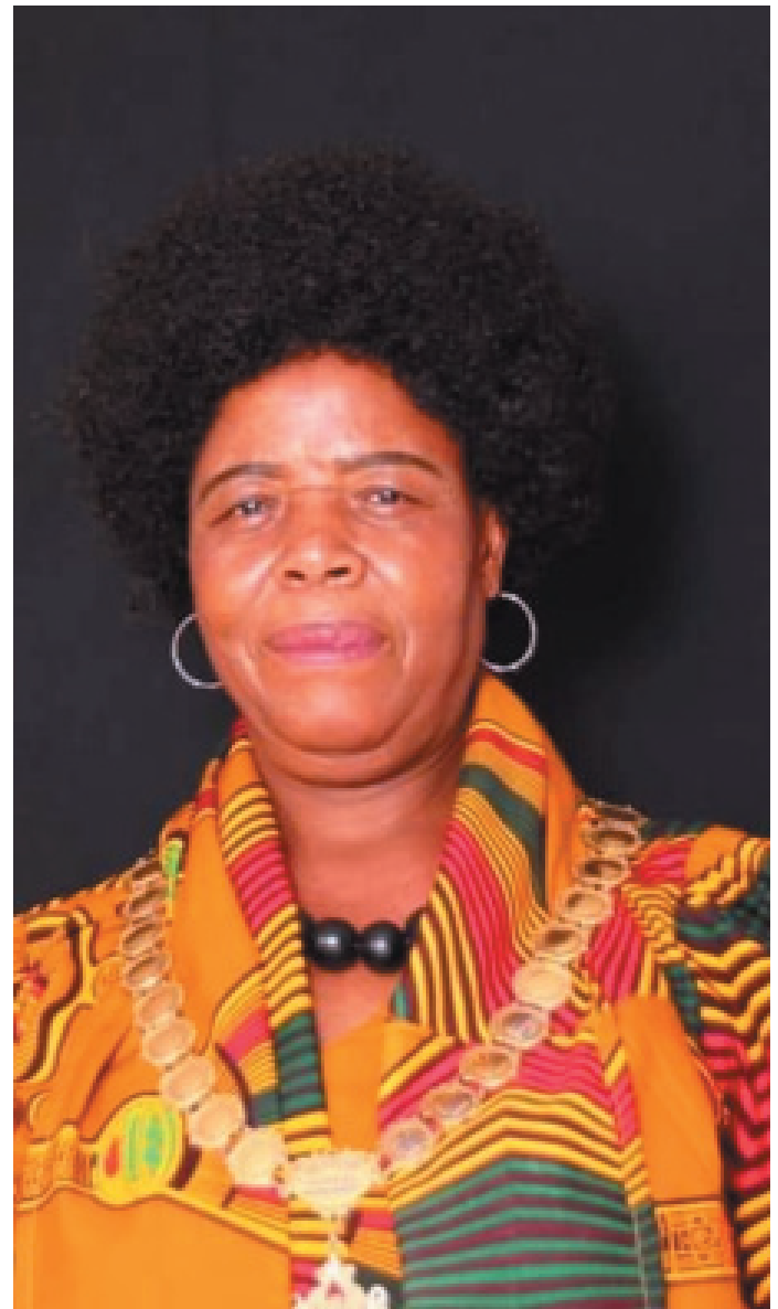
COUNCILLOR MARIA NKHOLANE THAMAGA MAYOR

Facebook/blouberg local municipality Twitter/@bloubergmunicip